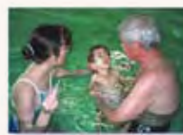
Documentary Film: "Embracing Sophia" Orinda Moraga Productions tells "a story of living with a loved one with a life threatening disease, of the state of integrative medicine in our country and of the need for palliative care for children."