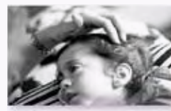
Documentary Photography Series: "Moment to Moment", "Language of Compassion" and "Healing is the Journey" "Being with Sophia is like being with an exquisite butterfly. One is awed by the experience of such lightness and beauty..."