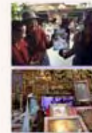
Global Prayer Flag Project A simple, yet powerful community building and awareness tool cast a circle of community and healing to the far reaches of Switzerland, Australia, Japan, China, Bulgaria and Tibet.